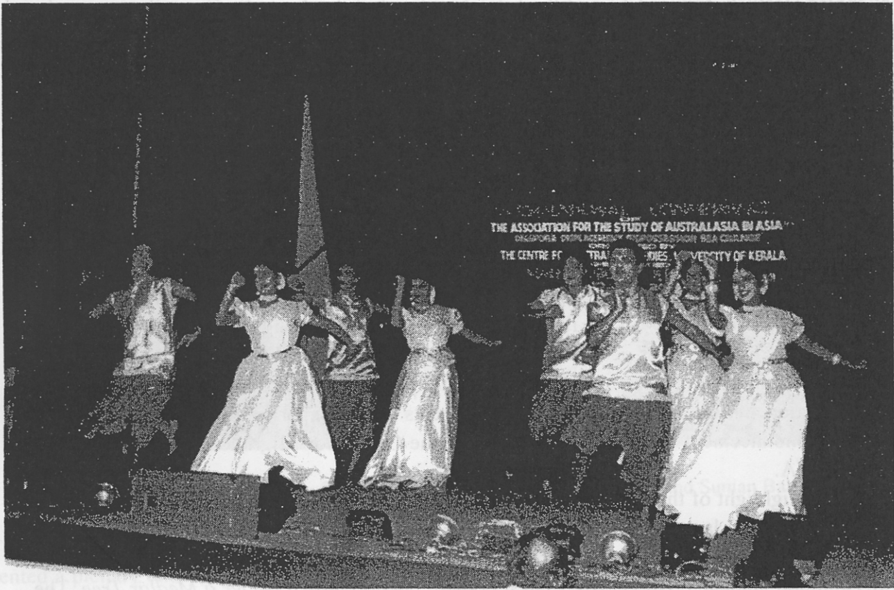
Cultural Show at the Conference