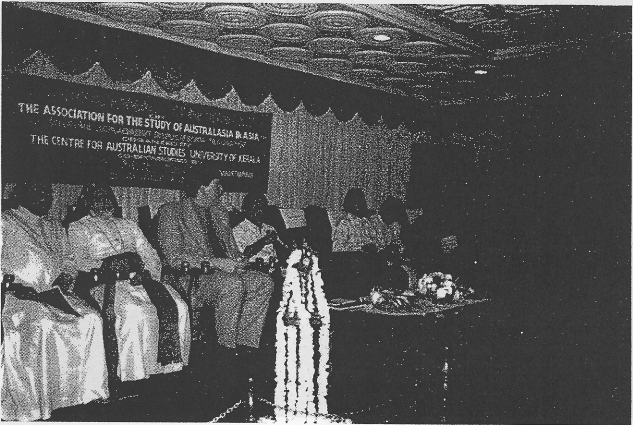
Cultural Show at the Conference