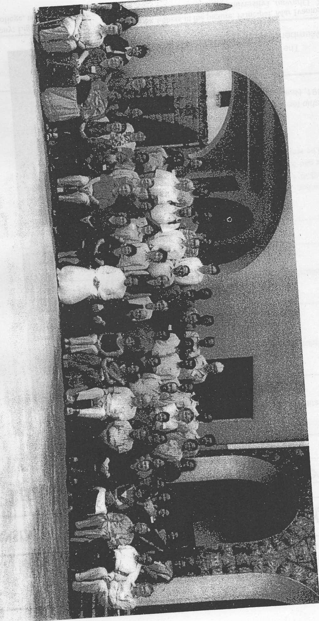
Participants: Third International ASAA Conference