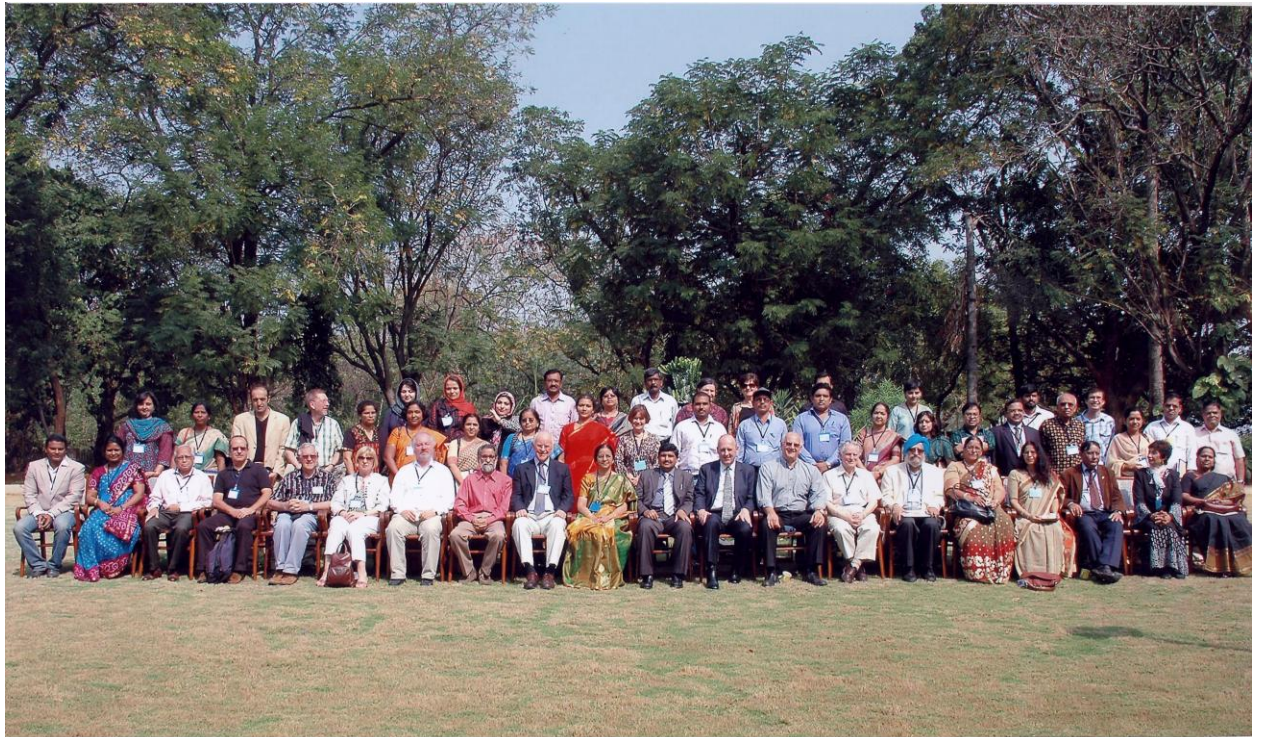
International Conference On Vanishing Borders in the age of Globalism : Australasian Perspectives 12th to 14th Dec 2011, OUCIP, India.

Association for the Study of Australasia in Asia Website: www.asaa.net.au